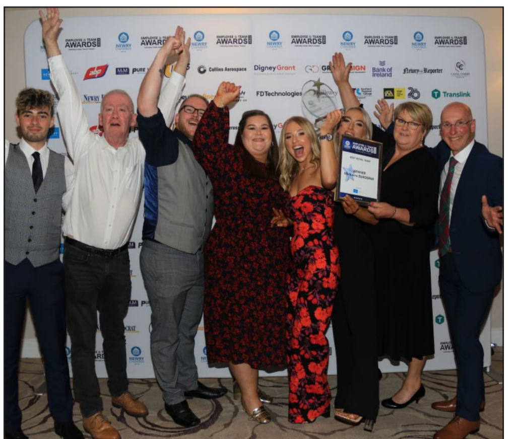
Mulkerns Eurospar Winners of the Best Retail Team award celebrate their success at Newry Chamber of Commerce & Trade Employee and Team Awards Ceremony.